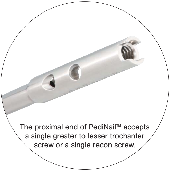
The proximal end of PediNail™ accepts a single greater to lesser trochanter screw or a single recon screw.