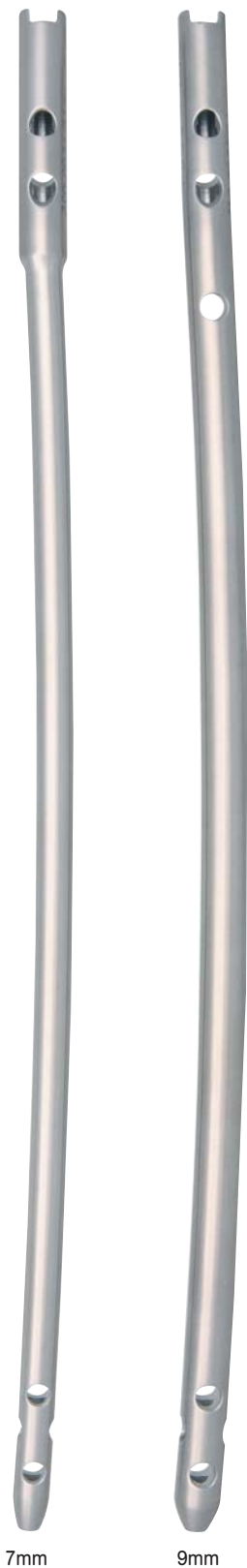
7mm 9mm (not shown actual size)