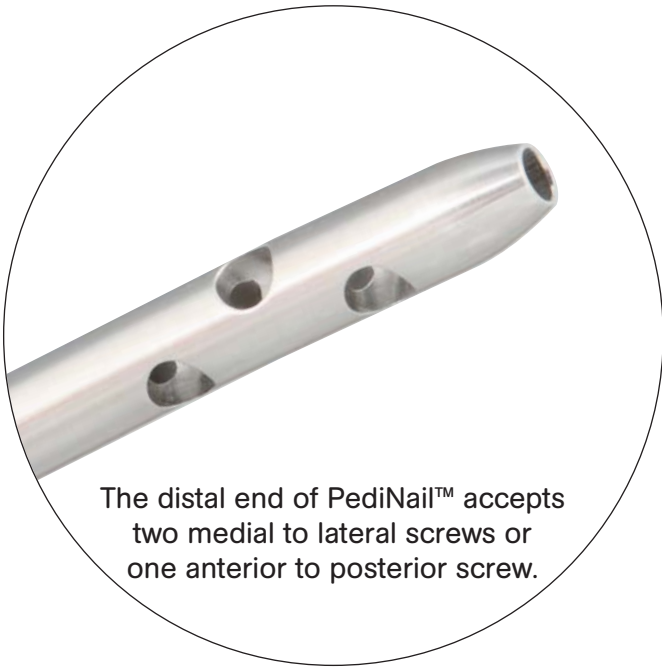
The distal end of PediNail™ accepts two medial to lateral screws or one anterior to posterior screw.